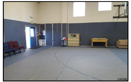
Gymnasium with Basketball Court